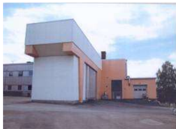
Figure D-3: Spent fuel storage facility. Kjeller site