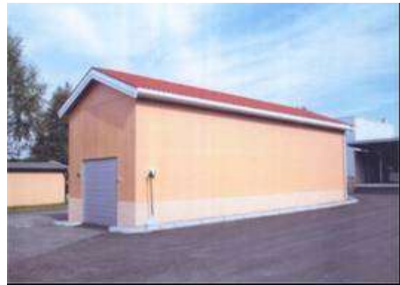
Figure D-2: Spent fuel storage facility (JEEP1, NORA)