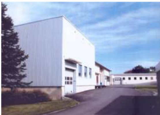
Figure D4: Radioactive waste facility, Kjeller site

This is a facility for receiving, sorting, handling, treatment and conditioning of radioactive waste, and is the only facility of this type in Norway. It receives all LILW generated by Norwegian industry, hospitals, universities, research organisations and defence. Treatment of disused smoke detectors takes place in this area as well.