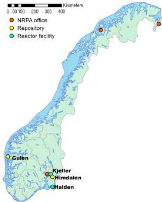
Figure D-1: Map of Norway with relevant sites