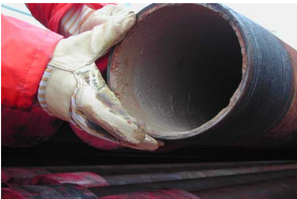
Production pipe scaling

Waste containing scale is continuously being produced due to petroleum extractions and the amount produced is expected to increase due to future decommissioning of oil platforms. It is assumed that in the next 30 years, about 3000 tons of such waste will be produced. The repository has capacity for 6000 tons of waste.