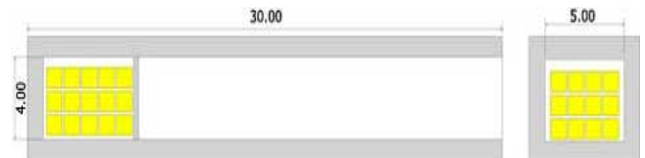
Sketch of a repository tunnel with concrete mould castings; units are measured in metres.

The repository has been assessed in relation to possible future impacts from e.g. flooding, mud slides, decomposition of barriers and attempted unlawful entry.