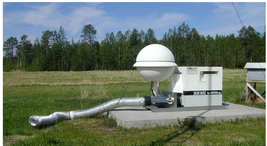
Air filter station at the Norwegian Radiation Protection Authority's Preparedness Unit at Svanhovd in Finnmark County.

The Norwegian Radiation Protection Authority currently has five air filter stations located at various sites throughout Norway. The stations are important for surveying airborne radioactivity, and for the assessment and composition of any emissions in the case of mishaps and accidents. There are similar stations throughout Europe, and the inter-state collaboration makes it possible to track any emissions of radioactive substances.