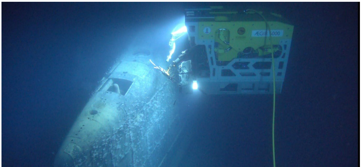
The sunken nuclear submarine Komsomolets on the seafloor in the Norwegian Sea.

A 2019 Norwegian research cruise to the sunken nuclear submarine Komsomolets has confirmed that radioactive releases from the reactor are still occurring. These releases have had little impact on the surrounding marine environment. The research cruise detected specific uranium and plutonium isotopes which suggest that the nuclear fuel assemblies have been damaged and that the nuclear fuel is in direct contact with seawater and deteriorating. Further work should be carried out to understand any corrosion processes and their implications.