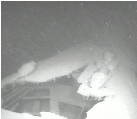
Damage to the outer hull of K-159 close to stern

Activity concentrations of Cs-137 in fish from the sampling area were low and comparable to reported values for the Norwegian Sea and Barents Sea.