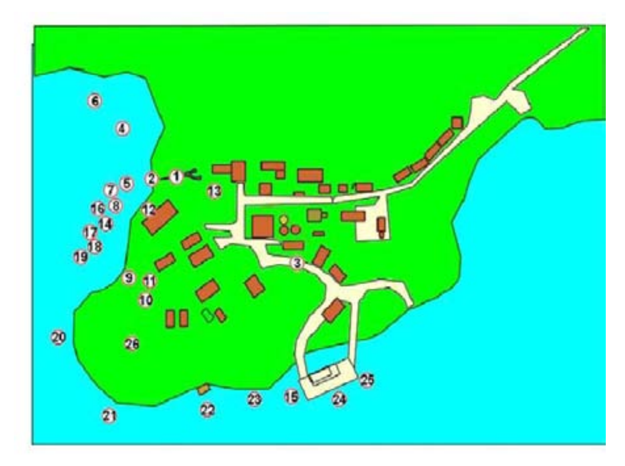
Figure 1. Sampling sites from the environmental study plan conducted by Navy specialists jointly with RSC "Kurchatovsky Institute" [Kurchatovsky Institute, 1997, 2000].